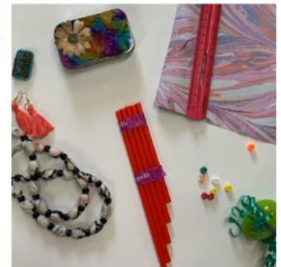
Girl Scouts Junior Badge Step Kits $20.00