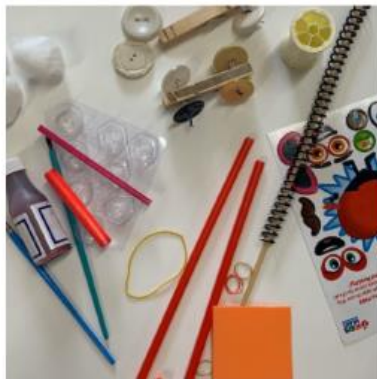
Girl Scouts Brownie Badge Step Kits $21.00